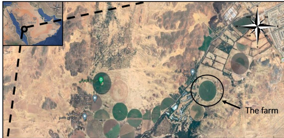
Figure 1. Location map of the Panicum Maximum farm located near Makkah city, Saudi Arabia