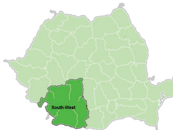
Figure 1. Romania – the South-West Oltenia Development Region

Like the other development regions, the South-West Development Region does not have administrative powers, its main functions being the coordination of regional development projects and the absorption of funds from the European Union. It consists of 5 counties: Dolj, Gorj, Mehedinți, Olt and Vâlcea, which form 82.4% from the Oltenia Historical Region. It ranks 7 th among the regions of the country, with 1,797,633 hectares, representing 12.32% of the national agricultural area. In the SV Oltenia Region there are 872.508 ha of forests, representing 12.83% of the national average, these being managed by the Forestry Directorates or belonging to the individual owners ( http://www.dolj.insse.ro/cmsdolj/rw/pages/index.ro.do ).